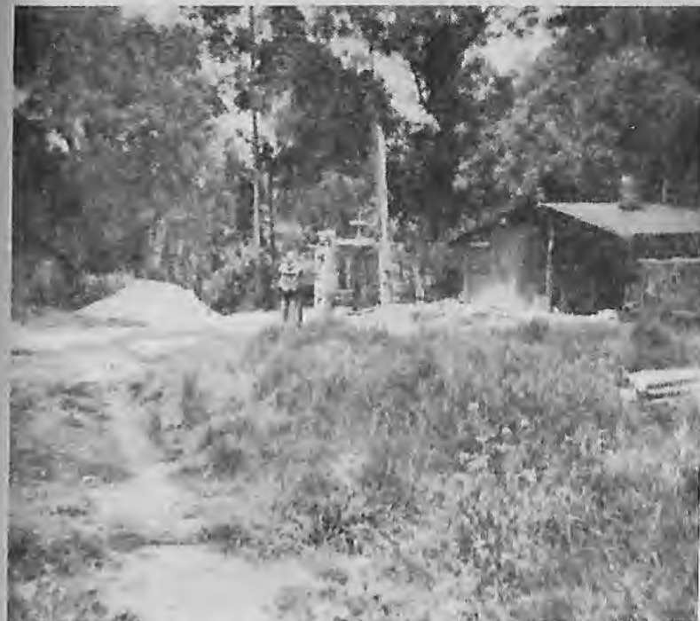
The walls surrounding the Vergel when they were first being built (summer 1971)

But today in the morning, when Jesus came to speak to me in the little kitchen, what He said to me immediately was thus: "I come to advise you to try to defend this place because it is a holy place, sanctified by My most holy Mother and especially beloved by Her for Her first descent from Heaven to earth."